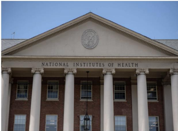
The National Institutes of Health in Bethesda, Md.