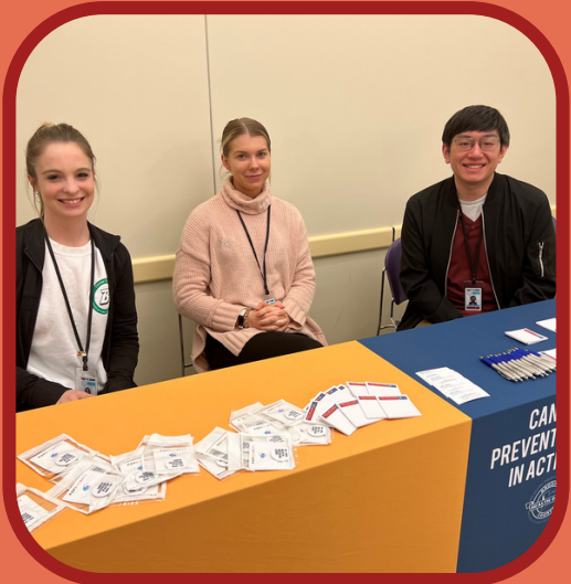
HPV awareness tabling at Binghamton University