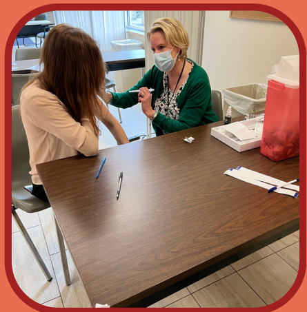
COVID-19 Vaccination Clinic