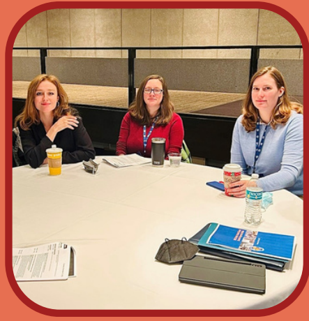
NYSPHC Consortium in Albany