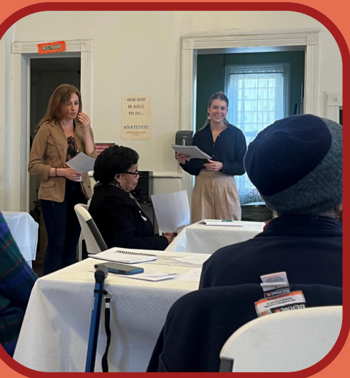
Broome-Tioga NAACP Presentation on Community Health Survey