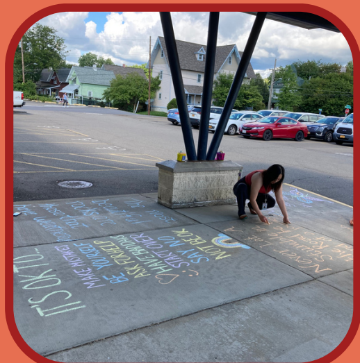
Mental Health Awareness Month at BCHD