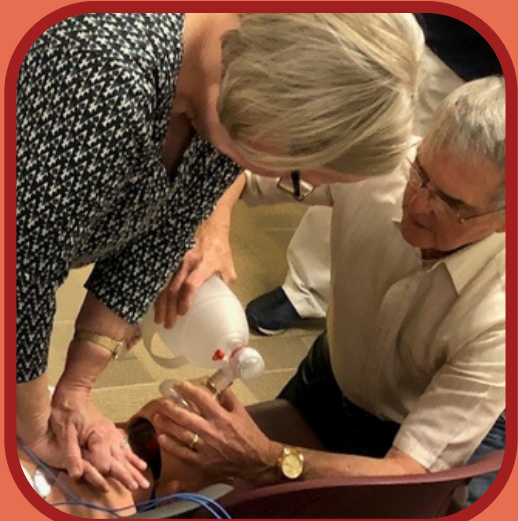
CPR & Narcan training for Medical Reserve Corp.