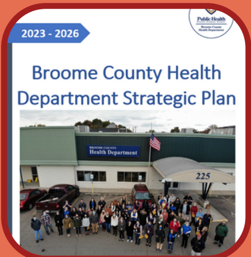
2023-2026 BCHD Strategic Plan