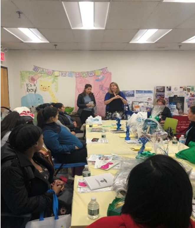
Suffolk Shower Program in Wyandanch NY –Sun River Health Center