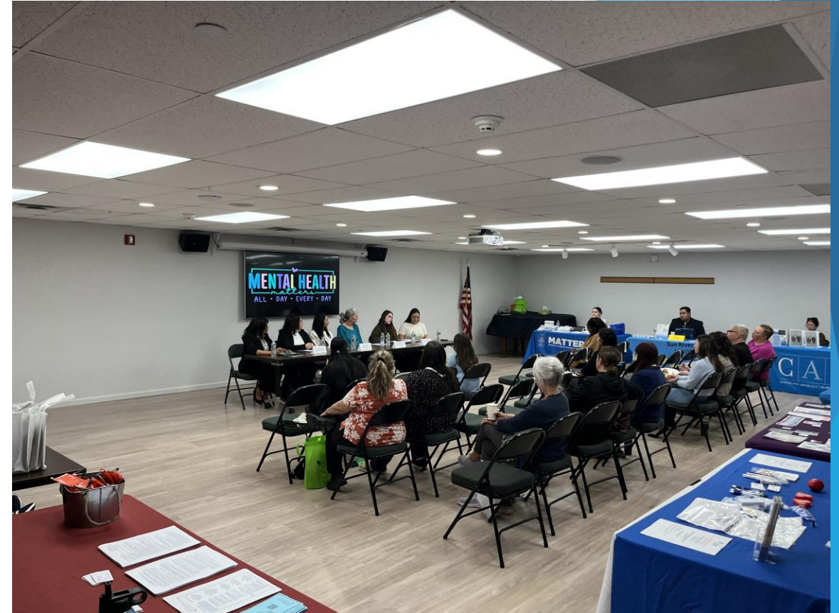
SC MAC Community Mental Health Forums: Boys and Girls Club in Bellport and Mattituck-Laurel Library