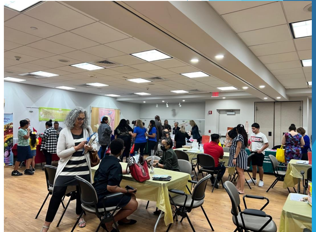
Suffolk Showers program at the Riverhead Public Library