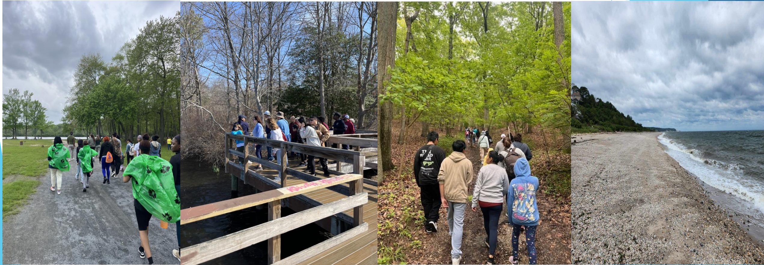
2025 Nature Walks: Belmont Lake, Lakeland County & Cordwood Landing Parks