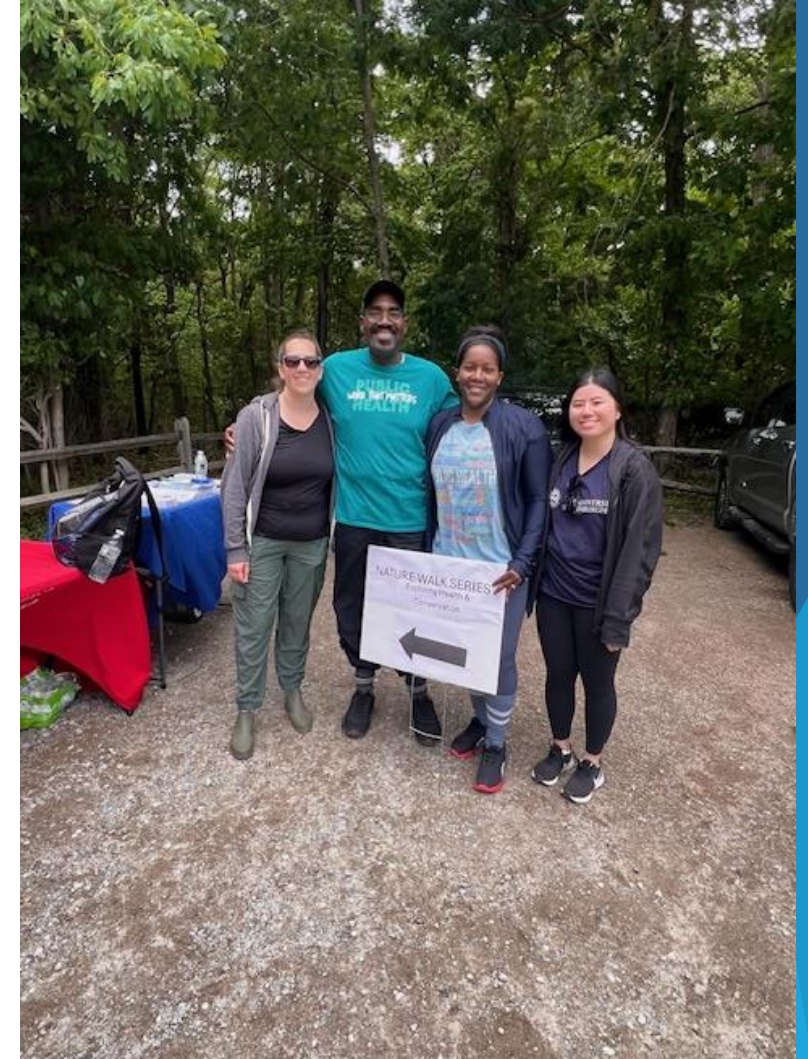
Our Office Team