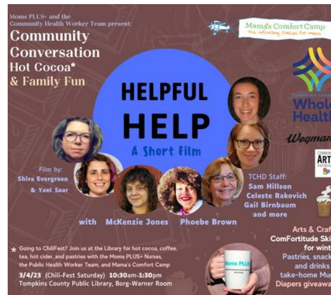
An event held for the community to meet CHWs and ask questions about the PICHC program. A short film about parenting was shown with a panel discussion.