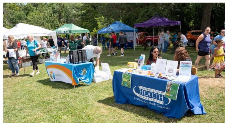
CHWs present at a local community event. An opportunity to meet community members and network with other CBOs present.